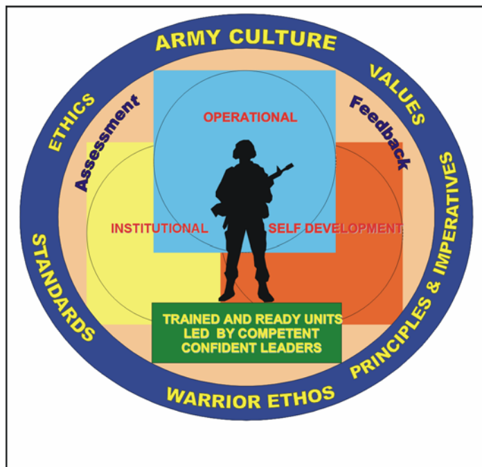
Figure 1-1. Army Training and Leader Development Model

(2) The Army Training and Leader Development Model (Figure 1-1) centers on developing trained and ready units led by competent and confident leaders. The model depicts an important dynamic that creates a lifelong learning process. The three core domains that shape the critical learning experiences throughout a Soldiers and leaders time span are the operational, institutional, and self-development domains. Together, these domains interact using feedback and assessment from various sources and methods to maximize warfighting readiness. Each domain has specific, measurable actions that must occur to develop our leaders.