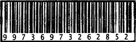
Figure 6-1. Sample labeling of records